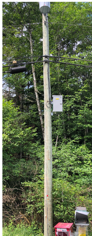
Power supply enclosure

For questions or to apply, email distribution.attachments@bchydro.com